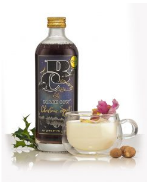
Cow Flipin (Black Cow)

Shake 50ml Black Cow Christmas Spirit, 60 ml double cream & 1 egg yolk with ice. Serve with grated nutmeg & Snapdragon Flower.